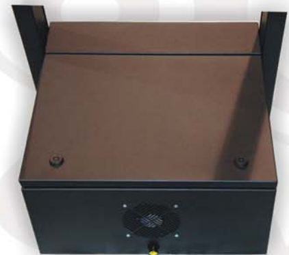
Optional lockable computer box comes with a 120 mm Cooling Fan, and Sealed Power Access