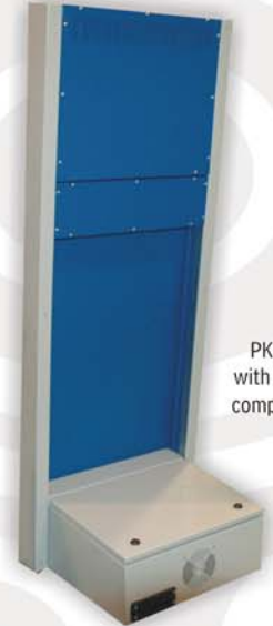
PKI-1900 with lockable computer box

In addition, with the lockable computer box at the bottom, customers can incorporate their own computer, media player, video game console, or any other system designed to their specific business needs. We also offer the optional Computer DPX.